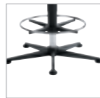
Foot ring for Unitec